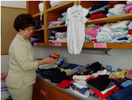
Selecting the right size and color.