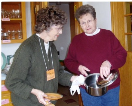
Finding the right set of dishes and cookware for the kids going to college.